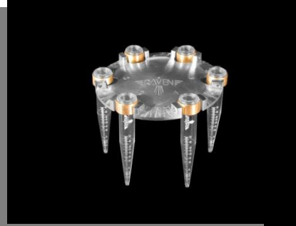
Tubes shown at rest in the bronze trunnion rings of the Raven Centrifuge horizontal rotor. Centrifuge model F-10300.