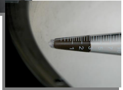
Conical shape of tube accentuates relatively small amounts of solids concentrations – as low as 00.20%.