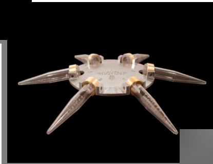
Tubes during ascent to full horizontal swing position.