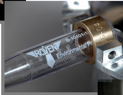
Tubes at full 90-degree angle to axis of rotation.